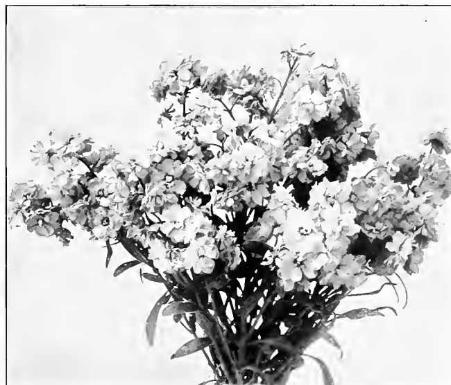
STOCKS—EARLY BRANCHING NICE